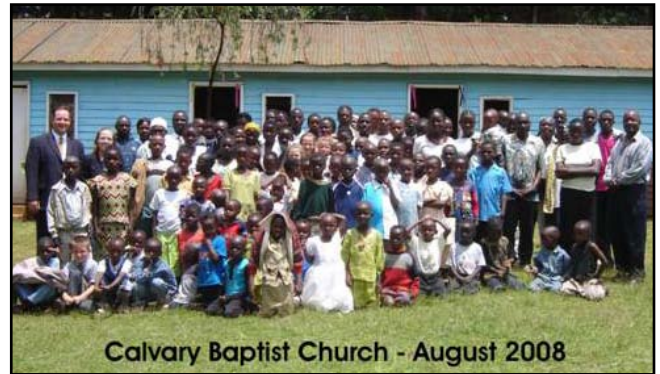
Calvary Baptist Church - August 2008

God is continuing to bless Calvary Baptist Church in Kisii town. We started the church in April of 2007 and we are using the property of another missionary (who moved from the area in the early 90's). It is on a piece of land that is about 3/4 acre, and it is located on the main road in Kisii town (population 85,000). We have had a high attendance of 202 on our First Anniversary Sunday. We are also using this property for our Bible College. There is a lot of potential in Kisii town, and Calvary Baptist Church is growing rapidly. We are excited about the possibilities of this work and its ability to reach Kisii town. We have opportunities to preach in the prisons, to city officials, police, schools, over the radio, and a television station all located in our town. Since the election violence many people have moved here (because of the safety in this area), and the possibilities are endless!!