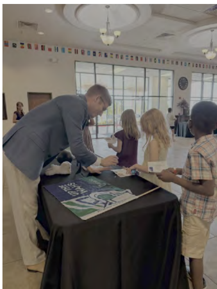
Left: Stamping “passports” at our table during a missions conference in Texas.