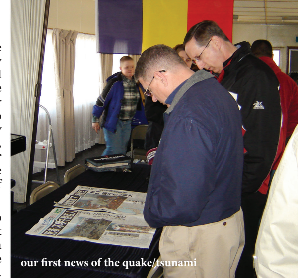
our first news of the quake/tsunami