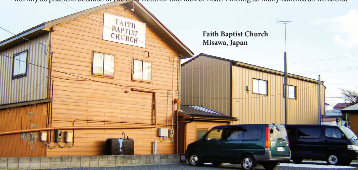
Faith Baptist Church Misawa, Japan

Since the conference was already planned, we prepared for the Friday night service. We dressed as warmly as possible because of the cold weather and lack of heat. Finding as many candles as we could,